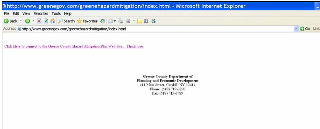
Figure 3-1. Screenshot of the Hazard Mitigation Plan Link on the Greene County Government Website